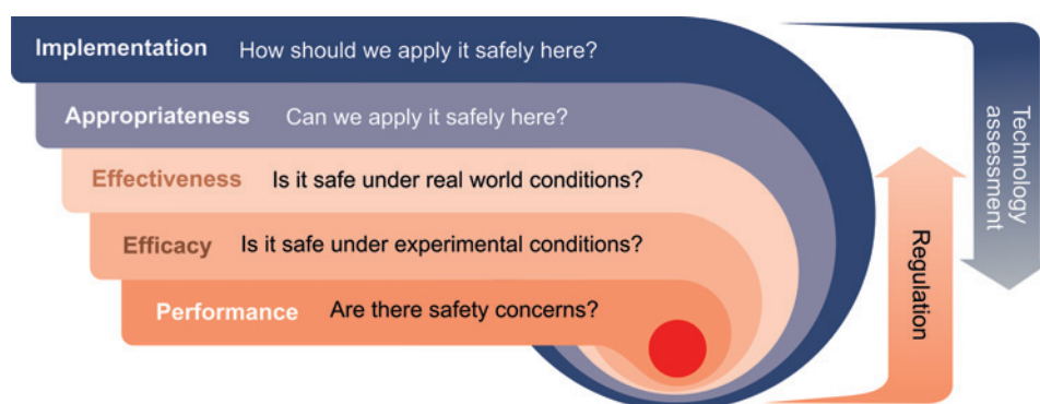
Figure 2 Questions about safety. Different questions about safety are asked at different stages in the introduction of technology.

The responsibility for training might be unclear. When laser laparoscopic surgery was introduced in the UK, it was neither